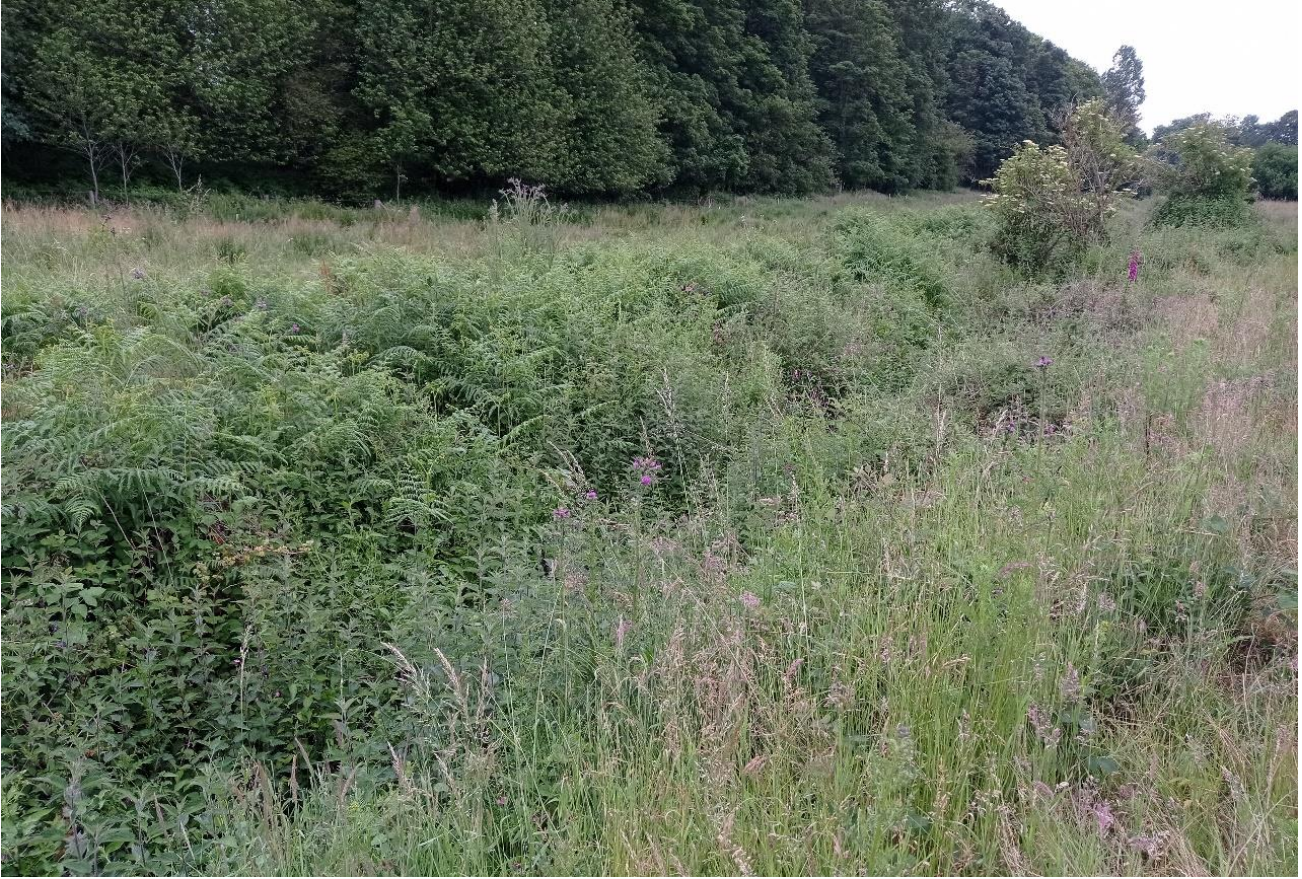
Figure A-1 – Foxburrow Stream banks and surrounding land