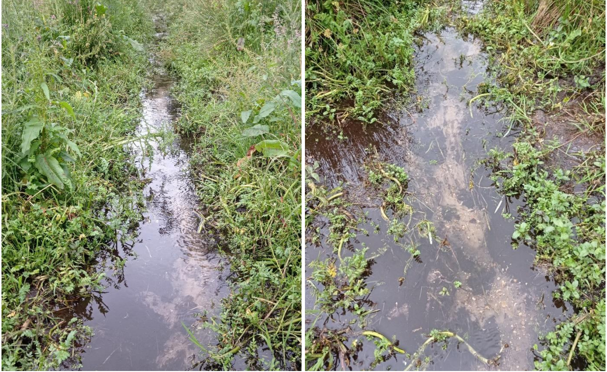
Figure A-3 - Foxburrow Stream aquatic zone and substrate in an open channel area