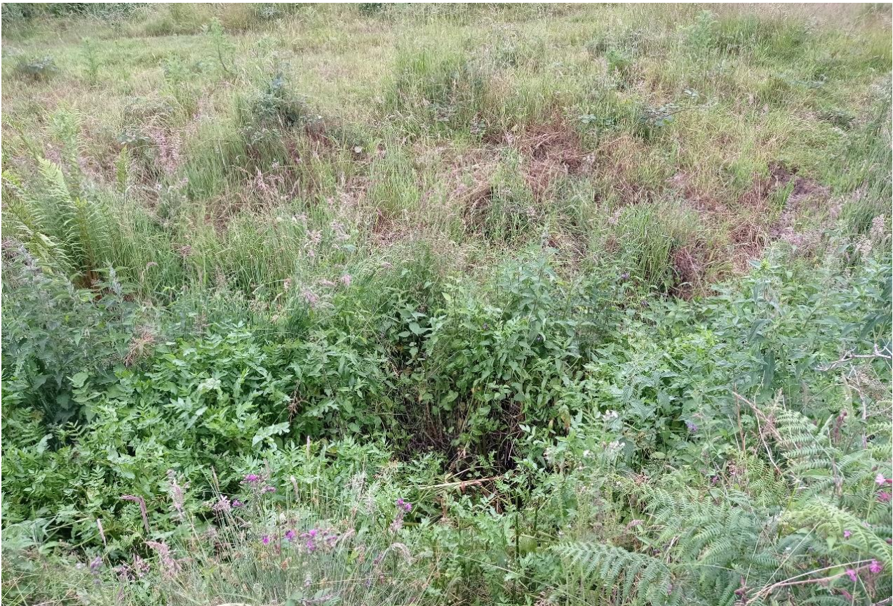
Figure A-2 - Foxburrow Stream channel and bank vegetation community